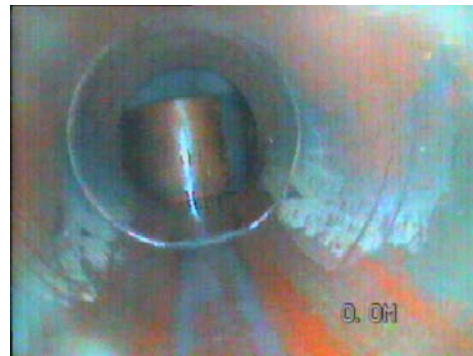
CCTV of interceptor