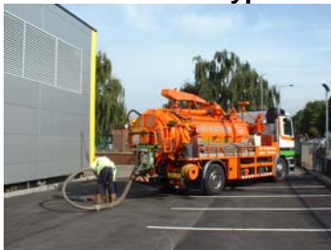
High pressure jetting

The Young Technical Services drainage management and reporting service has provided the basis of our clients environmental management systems, accreditation, and compliance. Our ability to react quickly and efficiently, to provide or source the most appropriate solution or advice has given our clients peace of mind with regard to all matters drainage.